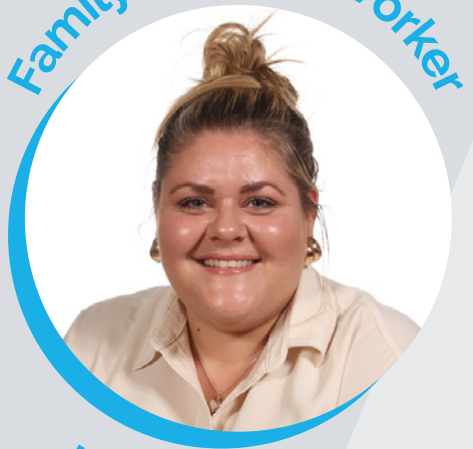
Miss C Pointing