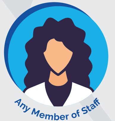
Any Member of Staff